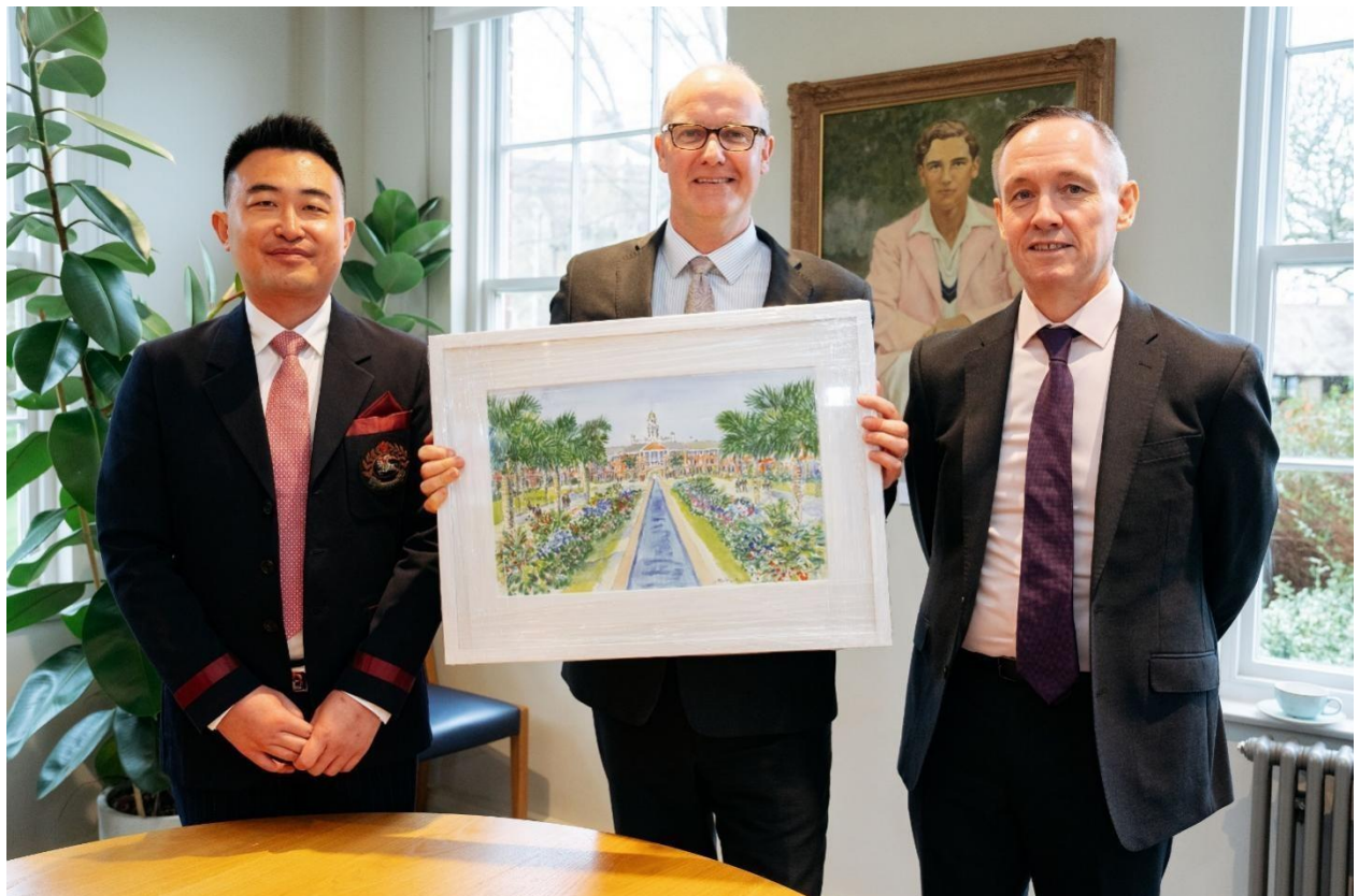
Official signing of the Charterhouse Lagos Agreement at Charterhouse UK